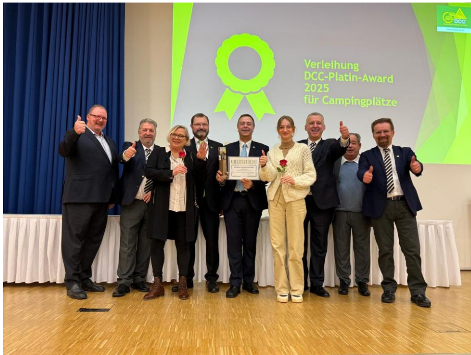
The F.I.C.C. Council and ladies from the F.I.C.C. Secretariat in Essen.

The F.I.C.C. Council held its 2025 spring session/meeting during the “Reise + Camping“ Fair in Essen (DE).