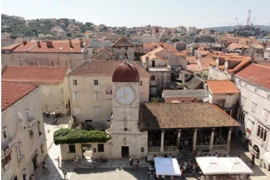
The old town

The Rally will take place from 22 to 29 June 2025 at the