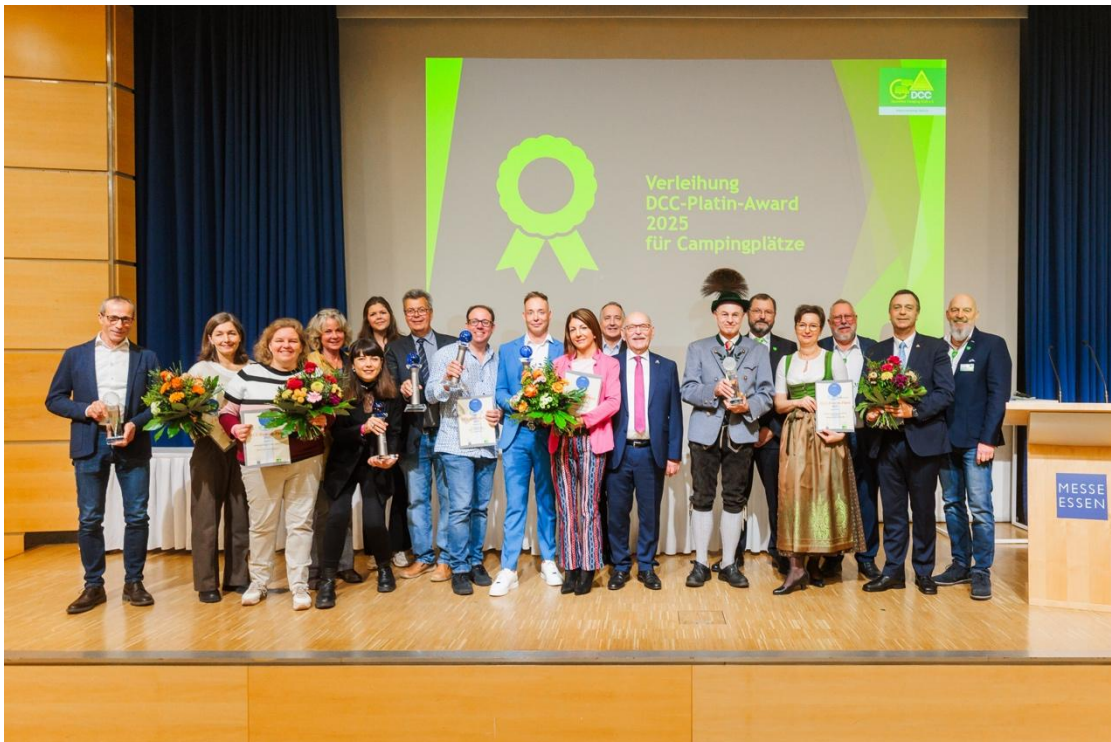
DCC award winners

The DCC Platinum Award was presented to Alpen-Caravanpark Tennsee/Germany, and Hells Holiday Resort/Austria.