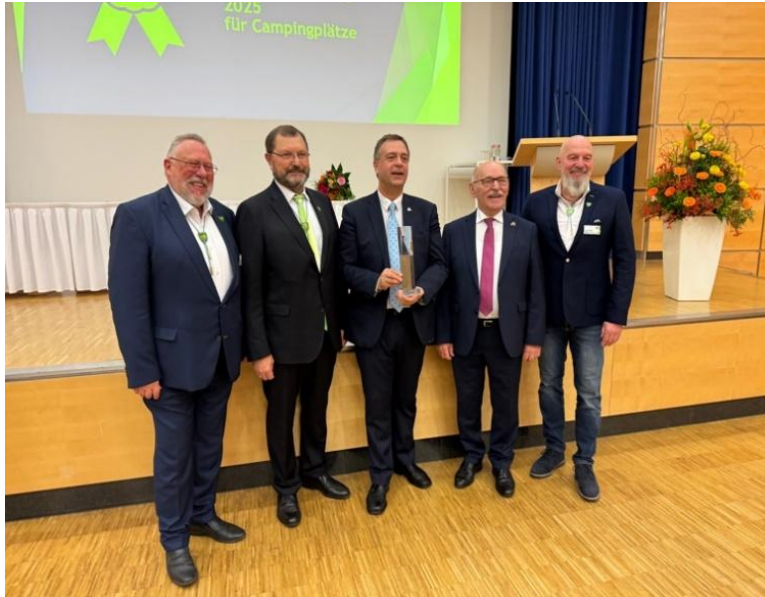
DCC Committee, F.I.C.C. President, Mayor of Essen