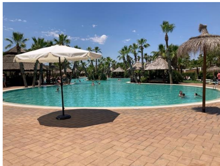
Alannia Resort