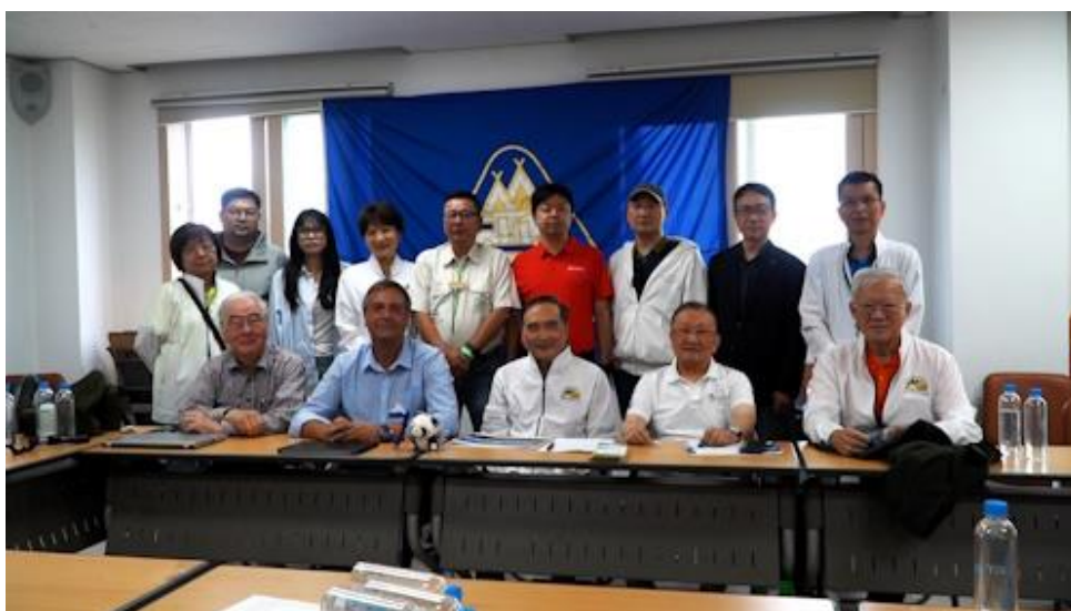
F.I.C.C. Asia- Pacific Commission