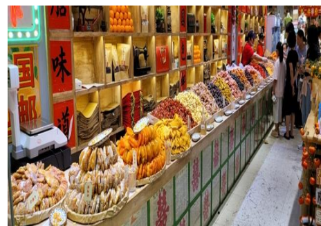
Culinary delights: Dried fruit - Lacquered Peking Duck