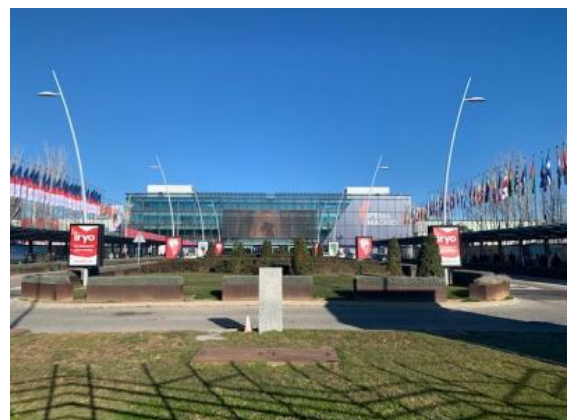
The exposition area