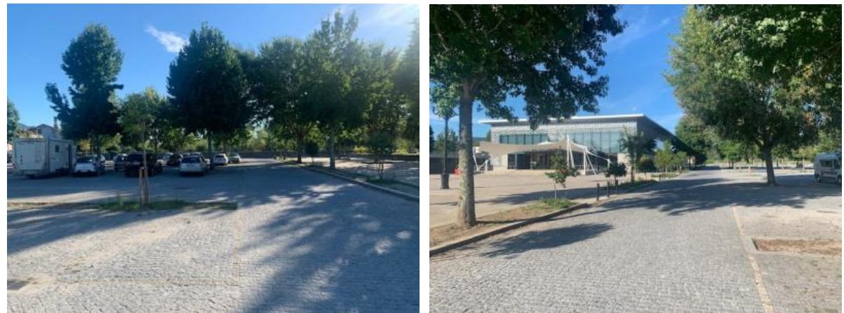
The free car park near the city centre is at your disposal